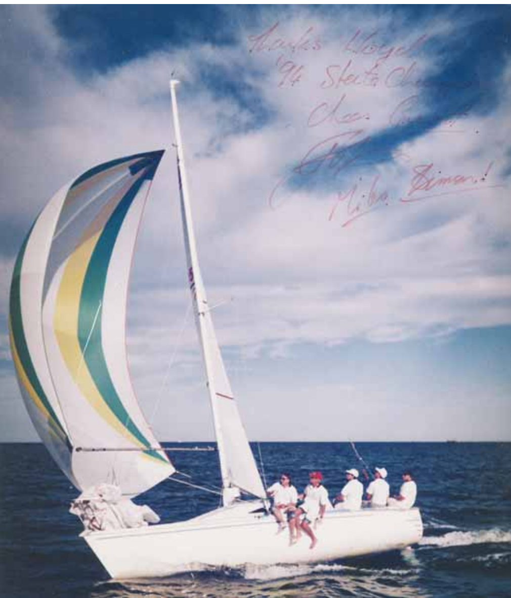
On the winning S80 – 1994 State Champions.

“Whilst the die hard America’s Cup followers will be squirming in their seats to think that multihulls will be used to fight for ‘the Auld mug’! I think the design/technology and building techniques