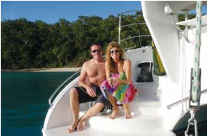
Time out – Palm Island, Whitsundays. (above left) Enjoying the Fusion 40 under sail. (above right)