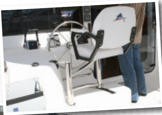
Left: This helm seat can be locked in several positions to suit the skipper.