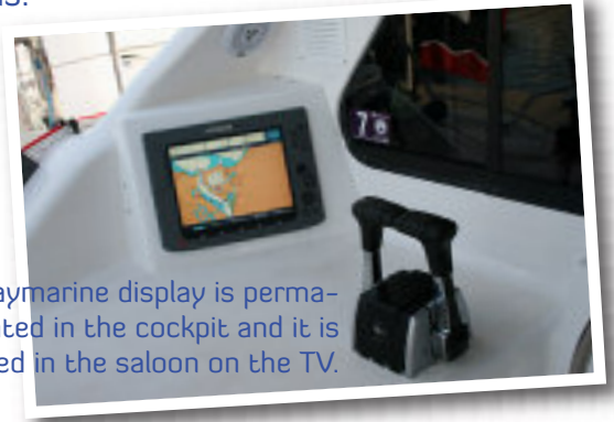
Right: The Raymarine display is permanently mounted in the cockpit and it is repeated in the saloon on the TV.